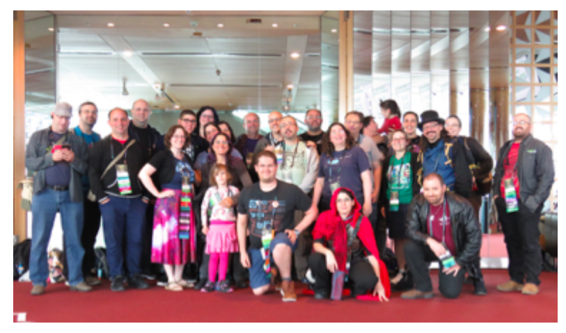
Some of the Israeli fans at Dublin2019.