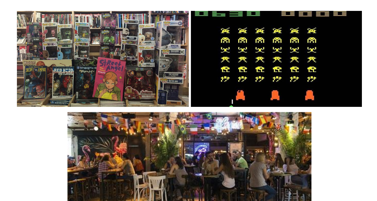
Comics and Vegetables (left), Cafe Tachtit (right), and Potion Bar (below).

Tel Aviv has quite a few geeky attractions such as the award winning Comics and Vegetables, a comics shop, Potion Bar (a geeky watering hole friendly to dragons), and Cafe Tachtit (where you can play old computer games along-side your meal).