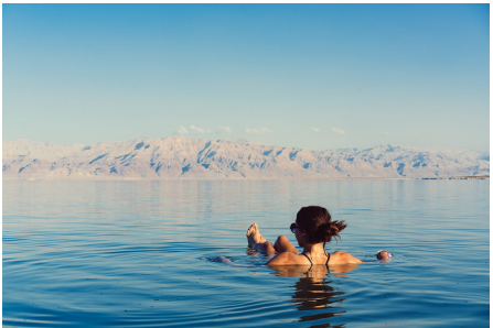
Jerusalem (left) and floating in the Dead Sea (right).