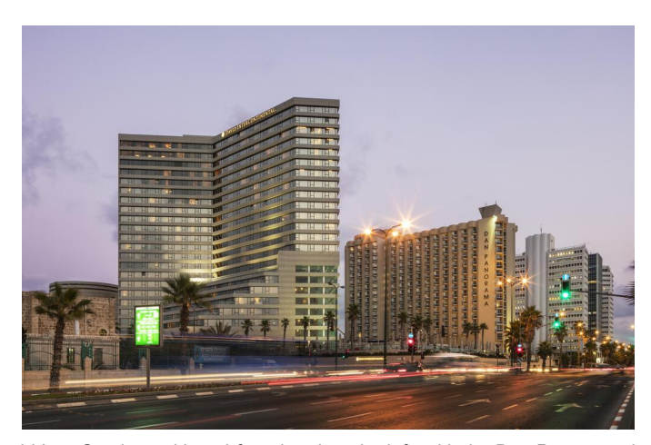
The David InterContinental beachfront hotel on the left, with the Dan Panorama beside it.

We have several sites we're exploring in several Israeli cities, but the city that seems most likely to be chosen is Tel Aviv. It is a cultural and business center with endless entertainment and culinary options, around the clock. Known for its food and friendly people, Tel Aviv is a beach city, and nearly everyone is fluent in English.