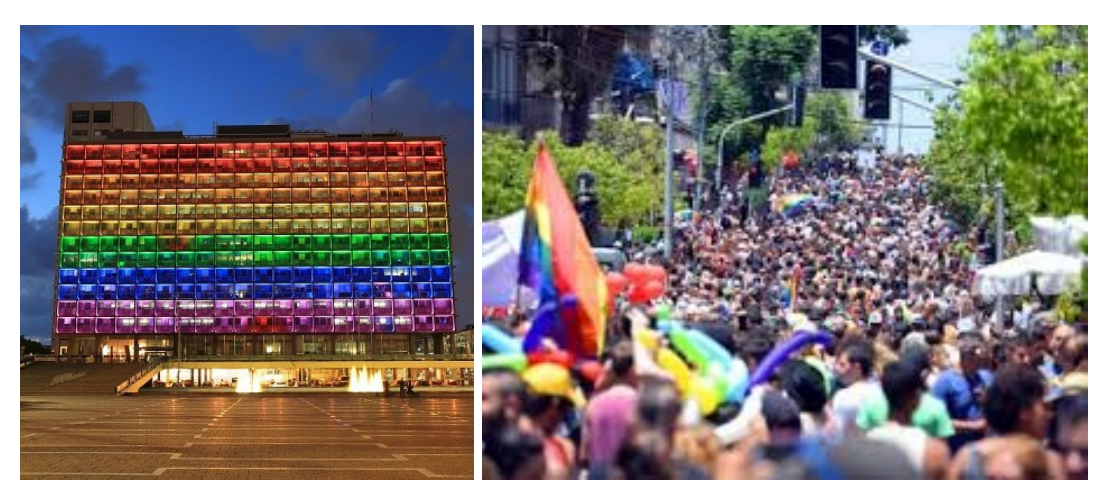
The Tel Aviv Pride Parade hosts 200,000 people from around the world. On the left is the Tel Aviv city hall during Pride Month.

Israeli fandom has a rich history of inclusivity, known for supporting LGBTQ+ youth. We strive for our conventions to be the safest space possible, including in the makeup of our staffing and programming consistently demonstrating a zero gender gap.