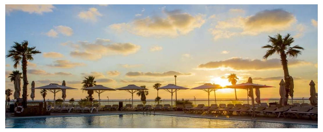
The David InterContinental hotel pool, with a view of the Tel Aviv beachfront.

As mentioned above, while we're looking at multiple options, our preferred venues* are David InterContinental Tel Aviv (our main preferred venue), and the adjacent Dan Panorama Tel Aviv, which are connected by a bridge.